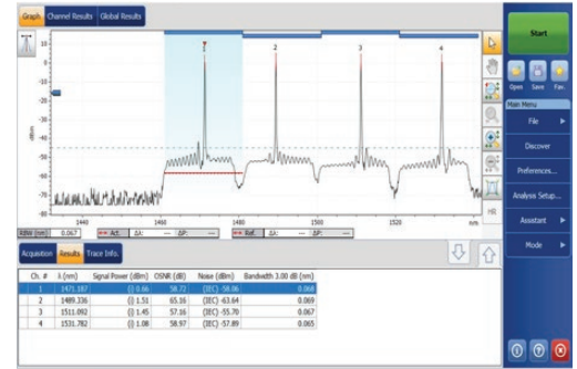
The FTBx-5235 displays channel power, channel wavelength and OSNR. Above: example of CWDM network OSA display. Below: example of DWDM network OSA display.

Cable operators are not just rolling out CWDM and DWDM, they are deploying hybrid networks, where DWDM wavelengths are overlaid onto CWDM wavelengths, as well as Remote PHY. EXFO's new and compact FTBx-5235 addresses all these applications with a single product, for maximum convenience.