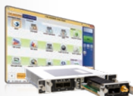
100G multiservice test module FTBx-88260/FTBx-88200NGE