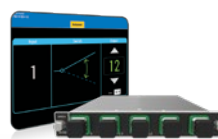
MEMS optical switch FTBx-9160 (1x2, 1x4 configuration)