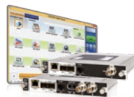
10G multiservice test modules FTBx-8870/8880